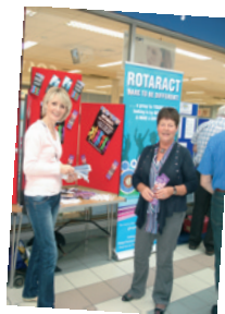
The Rotaract stand at MCW

evening was held on Wednesday 15th September at the Primavera Cafe at The Avenue as part of the normal weekly Club meeting.