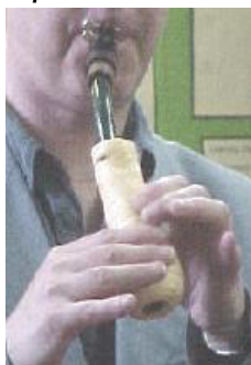
The parsniphone in performance

The real showstopper is when the pair show that almost anything can become a musical instrument, and demonstrate it by performing on real vegetables, such as a carrot, a parsnip, or sometimes even a mooli! We call them legumophones .