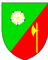
Shields 2\dia1-red + Shields 2\dia2-grn both flipped vertically Or Shields 1\Shld-red + Shields 2\dia2-grn flipped vertically Or Shields 1\Shld-grn + Shields 2\dia1-red flipped vertically