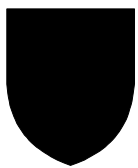
Shields 1\ Shld-blk