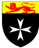
Same + Beasts\Lion 1, red , in yellow frame + Crosses\X-4-whi in black or transparent frame