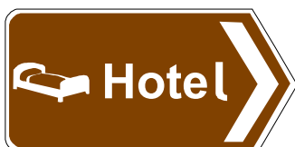
Transport & Travel\Road Signs\Tourist\Tourist2 + Transport & Travel\Road Signs\Tourist\Hotel } + Text ('Hote') (Arial, white, bold) } + Transport & Travel\Road Signs\General\l-white3 }

NB On a word-processing or DTP application, the frame for the latter requires transparent background or no pattern