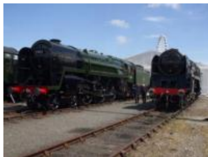
70013, Oliver Cromwell and 92220 Evening Star