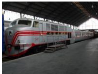
Talgo II Museo del Ferrocarril