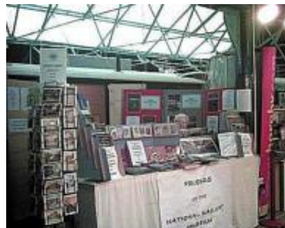
FNRM Enterprises stand (Phil Brown)