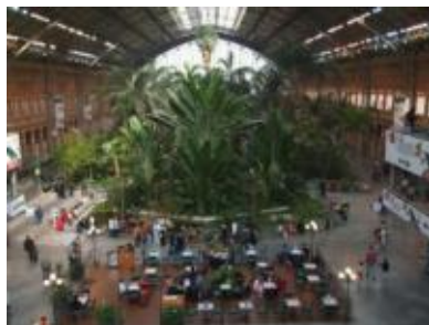
Tropical garden Atocha Station, Madrid