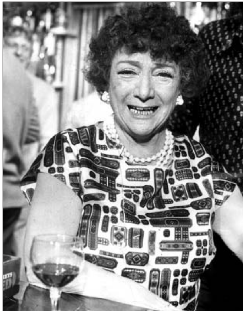
COMEDY GIRL: Hylda Baker was born and bred in Farnworth