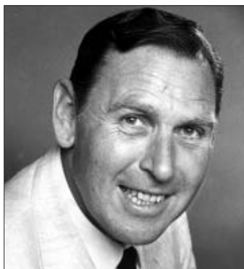
COMMENTATOR: Kenneth Wolstenholme