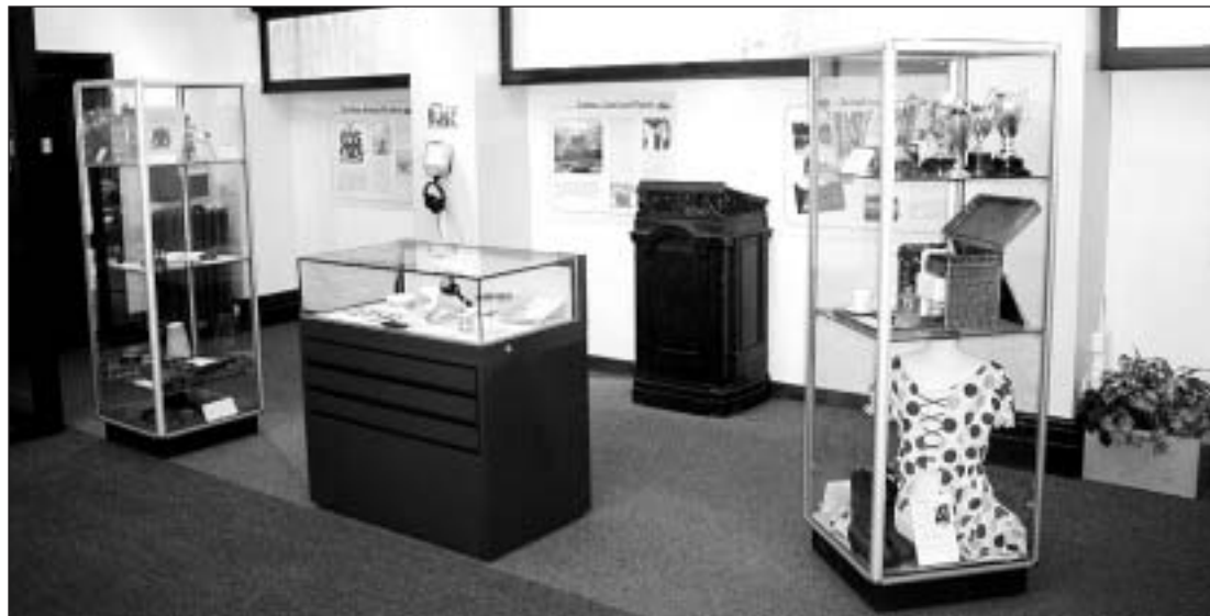
ON DISPLAY: Farnworth Library's history exhibition which includes a Hylda Baker polka dot dress on display in the glass case on the right