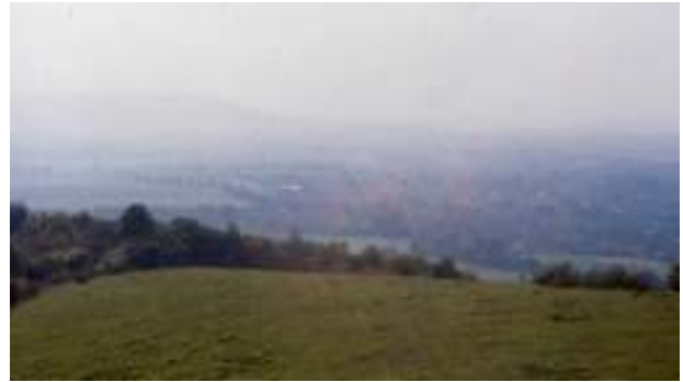
Friday: on the edge of the Chiltern Hills overlooking Wendover

I arrived at the Well House Restaurant about 17.30 and was shown to my room. In the evening I joined company with some diners who were having a birthday meal and celebration. I enjoyed a superb evening of good food and much laughter. On Friday morning, I noticed an interesting musical instrument, a Harmonium, for sale in an antique shop. I figured I would come back the following week and possibly buy it.