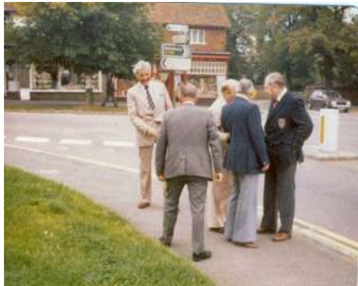
Yes, it really is you !

The elderly gentleman from the 5 th Entry gave me a lift up to 1 & 2 Wings. When we arrived there it would seem that he was expecting a march down to Workshops but there wasn't. At the Airfields there were queues to register one's presence. The guy in the beige suit clearly recognised me and I think he is the son-in-law of a Warrant