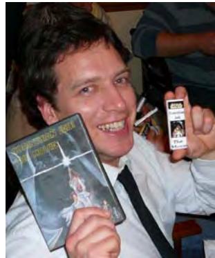
Look at my free gifts!! I'm so lucky