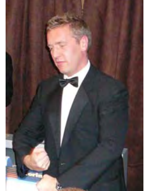
Compare for the night Minor celeb. Moore