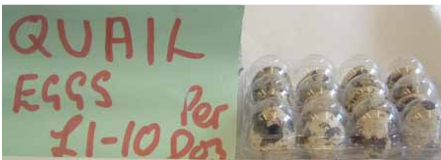
You can find unusual produce at farmers markets and farm shops

B-FIT would like to thank Rural Business Networks for supporting this promotional brochure, as part of a B-FIT promotion and membership development project. RBN supports the development of rural business networks and connects them with wider business support networks.