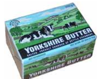
Some supermarkets are stocking more local and regional items. Look out for Yorkshire rhubarb, eggs and dairy produce.