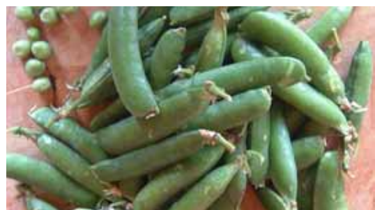
Peas lose their sweetness soon after picking

Farmers' markets provide a valuable outlet for small-scale local producers and have been shown to help revitalise town centres by attracting locals and tourists alike. Many stallholders are farmers with the freshest produce you can find, and those providing prepared foods like baked goods are supported in their efforts to use local ingredients where possible. B-FIT supports producers in selling produce locally through other farmers' markets in the region and through other routes to local markets like farm shops and independent retailers.