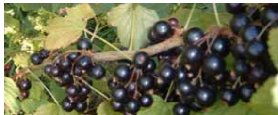
Yorkshire fruit is in short supply, producing just 5% of the UK total. Just 4% of the fruit we eat in the UK is grown here, with the other 96% being imported. Some kinds of fruit, particularly soft fruit like blackcurrants and raspberries, grow well in parts of Yorkshire.