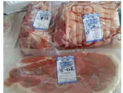
There are several independent butchers and farm shops selling local meat in the Bradford area.

B-FIT aims to help make a full range of local produce easily accessible to all. This leaflet has details of some outlets in and around the Bradford area. At farmers markets you can meet the producer, and some farm shops are working farms where you can see how the food is produced. Only small quantities of fruit and vegetables are grown in the Bradford area. Some independent shops have local items like milk and eggs. Supermarkets' purchasing and distribution systems mean that most of the stock travels long distances, but some are developing a local range. Some restaurants specialise in local ingredients.