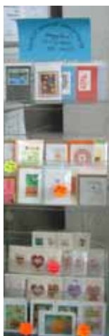
Cards from a local school