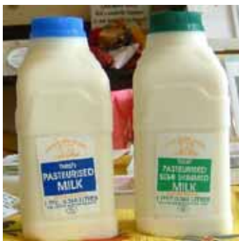
You can find some local produce, like milk, in independent shops