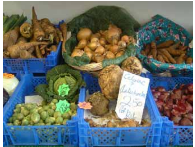
Fresh local vegetables at Keighley Local Produce Shop

Local produce means less environmental damage from petrol, packaging and refrigeration. Buying locally has social and economic benefits too. It means we know the provenance of our food, and helps rebuild links between urban areas and the nearby countryside.