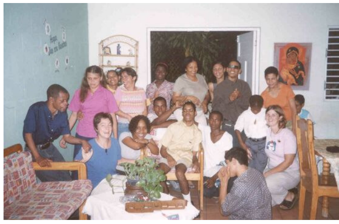
Here are the residents and staff of the project at Christmas.

It will be my duty help with the day-to-day running of the home and for the care of the residents. This includes preparing the evening meal for the residents. My partner and I will be jointly responsible for devising and organising activities and outings for the residents as well as working in a local school and a workshop in which the residents and other members of the community learn new skills.