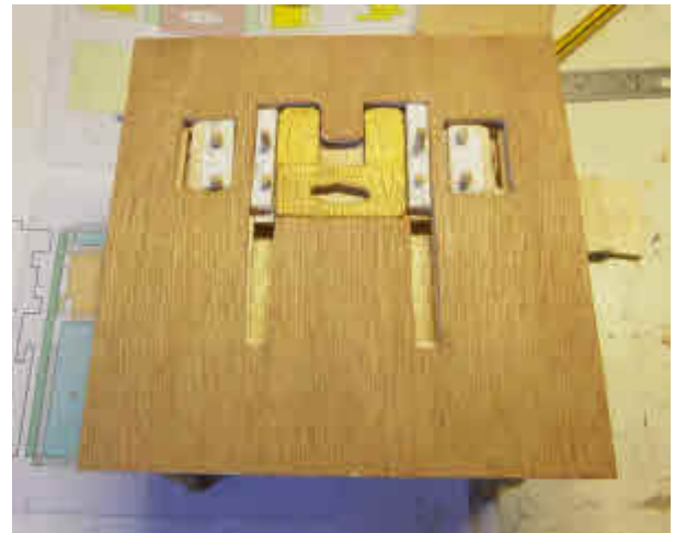
The lid top layer. The key's position is shown here.