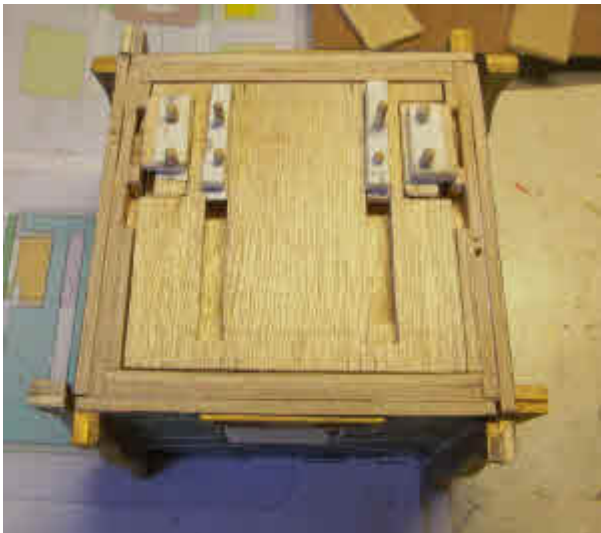
The moving parts of the first and top layers, glued together with pegs, which will line up with the outer sliders.