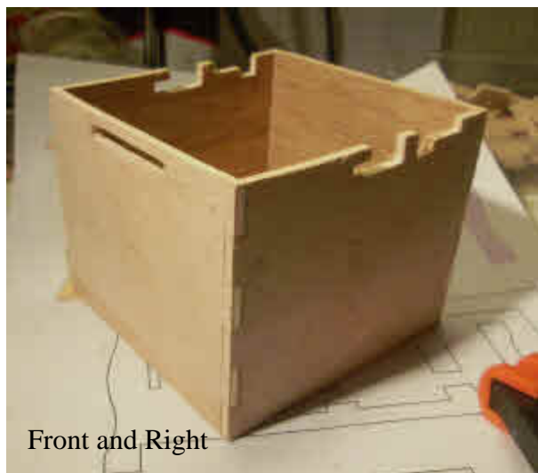
Front and Right

These photos were taken during the construction of the Marble Puzzle Box. If you're making this box from the T-Plans, these photos may help you to understand how to assemble the box.