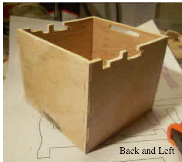
Back and Left