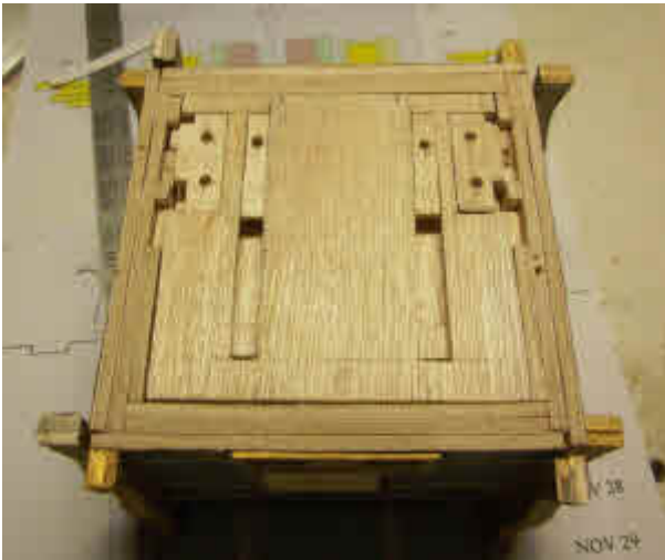
The lid's inner cover and second layer pieces in place.

Assembly of the lid is done while it's in place on the box, so the pieces can be tested at each stage.