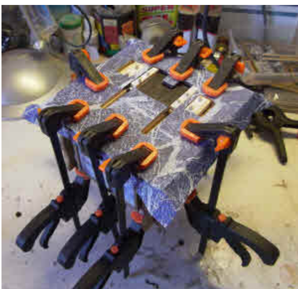
Gluing the whole lid together, with the paper pattern. The edges will be wrapped around underneath the lid.