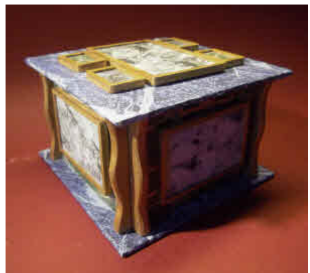
With the lid's outer sliders and the box base glued into place, the box is finished.