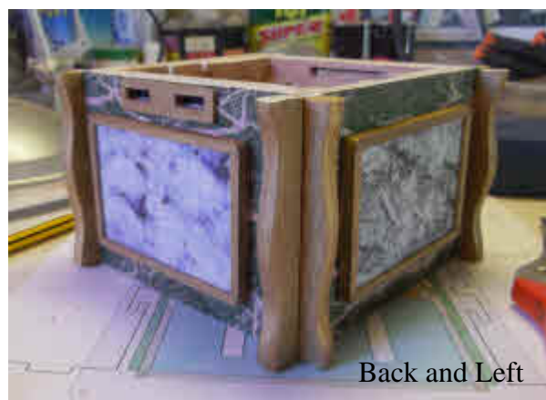
Back and Left

The side outer panels in place. Four of the columns are fixed, four are movable. One of the key slots is false, one is real. You can tell from this view which is which.