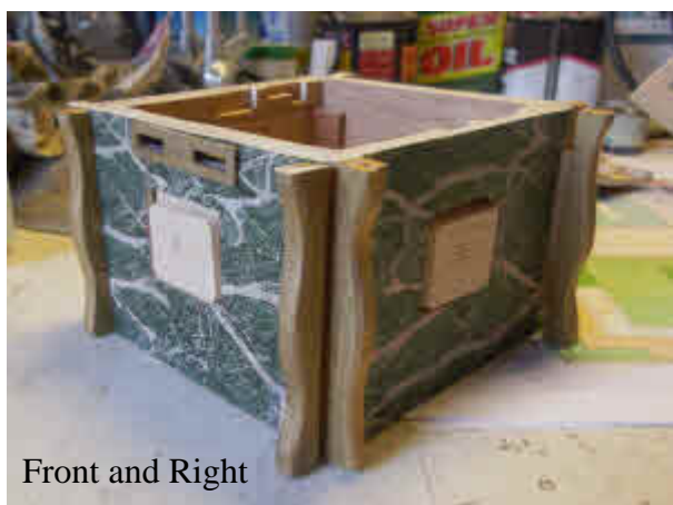
Front and Right

The side panels first layer pieces in place.