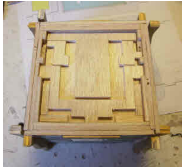
Some of the lid's first layer pieces in place.